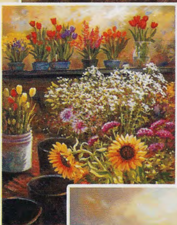
The Flower Shop