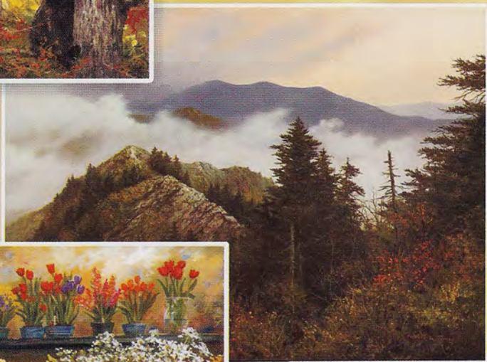
Will of the Wind