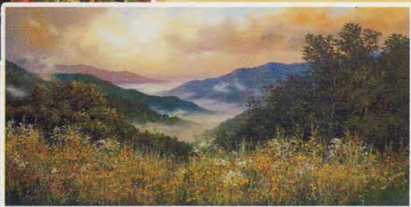
Follow the Sun