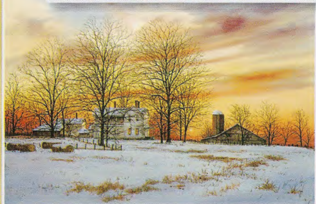
Night Divides the Day