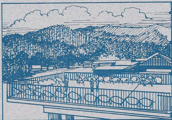
GREAT VIEWS FROM OUR OBSERVATION DECK